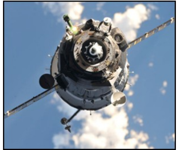
The Soyuz TMA-20 spacecraft approaches the International Space Station, carrying Russian cosmonaut Dmitry Kondratyev, Soyuz commander and Expedition 26 flight engineer; along with NASA astronaut Catherine (Cady) Coleman and European Space Agency astronaut Paolo Nespoli, both flight engineers. Docking of the two spacecraft occurred at 3:11 p.m. (EST) on Dec. 17, 2010.