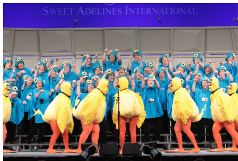
Lone Star Chorus international competition

The day of competition was long since we were the last to compete. We boarded the bus and when you get anxious...well you know, and being stuffed into an all-in-one is bad enough (yes, they were on even under that loose fitting poncho), but our ducks...god love 'em...were stuffed and SEWN into their costumes. Our favorite warm up song on the bus became "I do not have to ___" sung in perfect 4-part harmony!