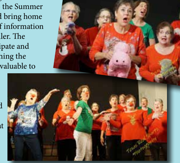
We Need a Little Christmas... NOW Show

the members who attended. Then our directors were able to apply what we learned in our rehearsals and we also learned a great deal more at our all day "Work the Craft" workshop in July.