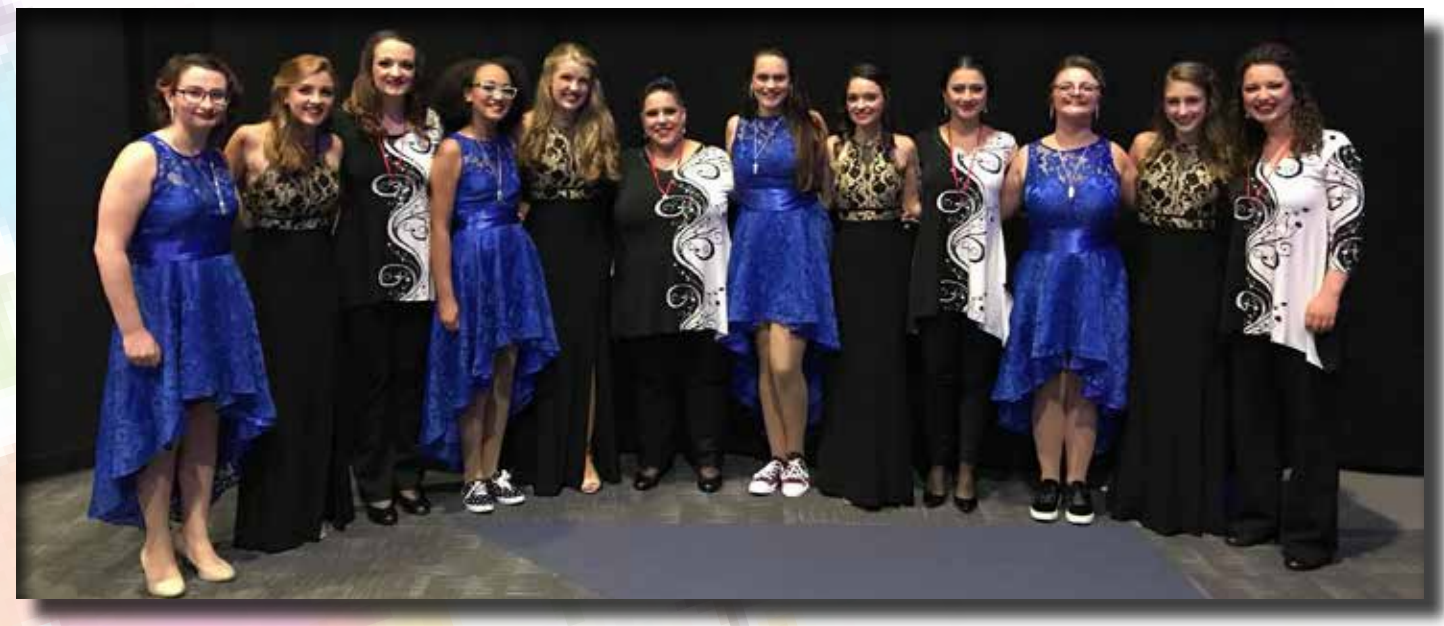
2018 Great Gulf Coast Region 10 Sweet Adelines International Young Women in Harmony competitors*: Grace Notes, The Belle Tones & Minor League