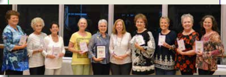
2018-19 Board of Directors.

Chisholm Trail Chorus hears sleigh bells ringing, and it's still summer! We are polishing up our Christmas/holiday tunes for a "Jingle Tour" in December that includes three stops in Georgetown on December 1 and concludes with a staged performance on Dec 13 at The Beltonian Theatre in Belton, TX. The Beltonian (http://thebeltoniantheatre.com/) is a refurbished movie theater that has showcased movies and live events since 1922. The owners are classically trained singers and will join us on stage during our performance. Our chorus always tries to partner with community groups to maximize our visibility whenever possible.