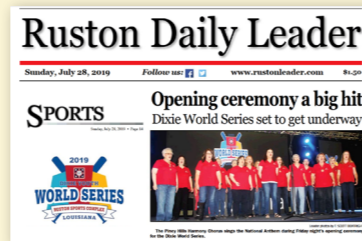
Piney Hills Harmony made the front page of the local paper when they sang the national anthem at the Dixie Youth World Series.