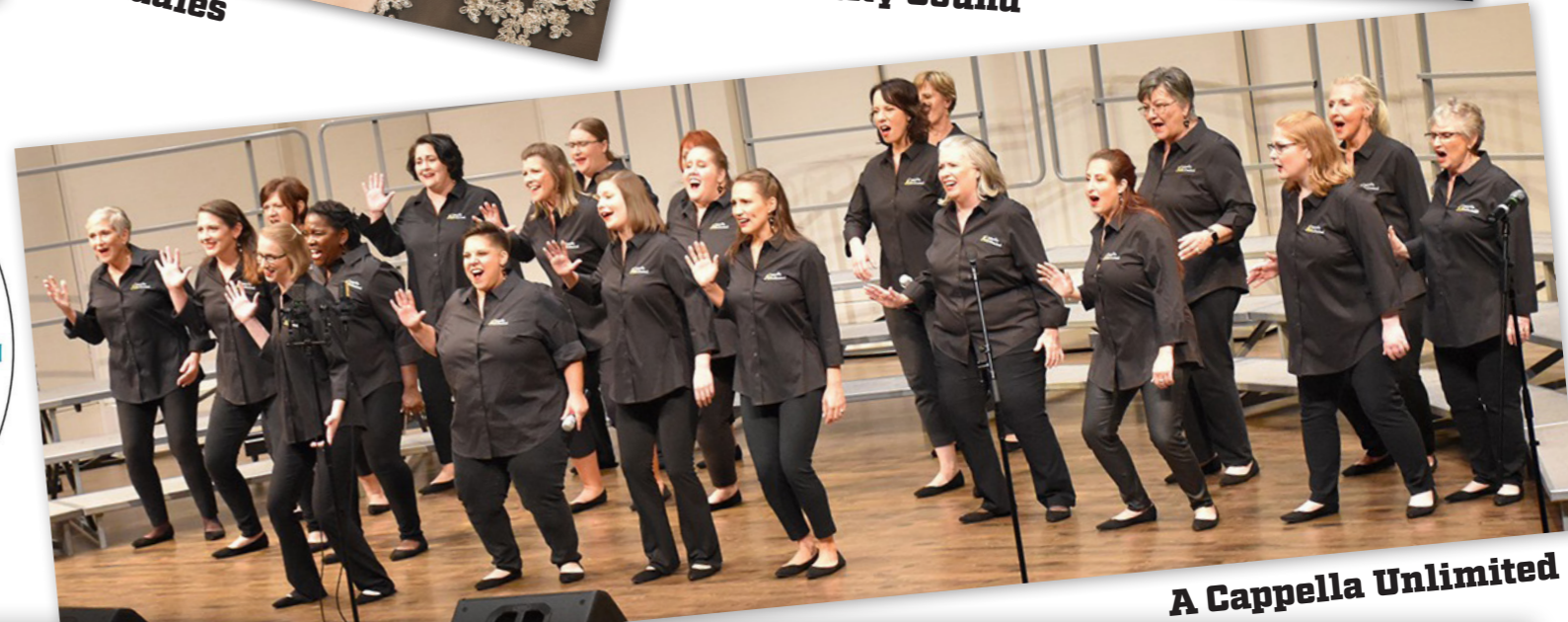
A Cappella Unlimited