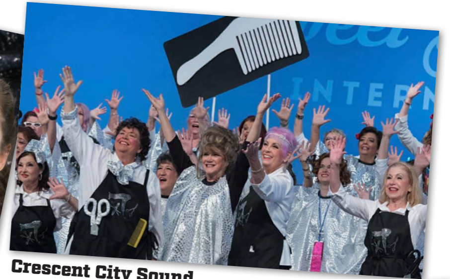
Crescent City Sound